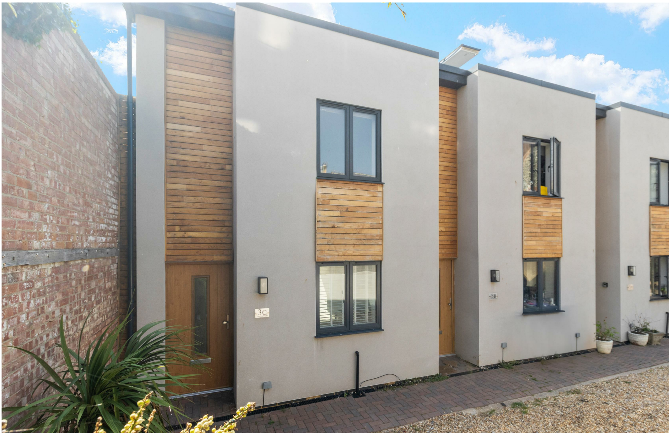
3C PHOENIX MEWS, SEAFORD, BN25 1HZ